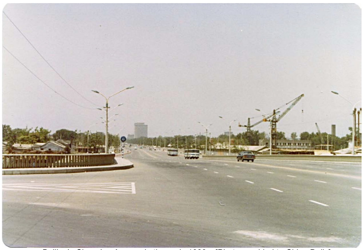
Beijing's Chang'an Avenue in the early 1980s.