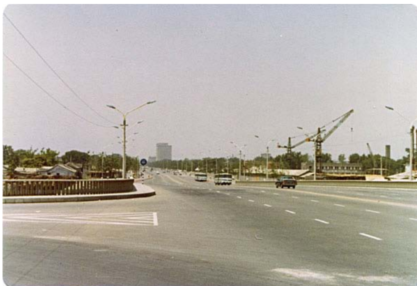
Beijing's Chang'an Avenue in the early 1980s.