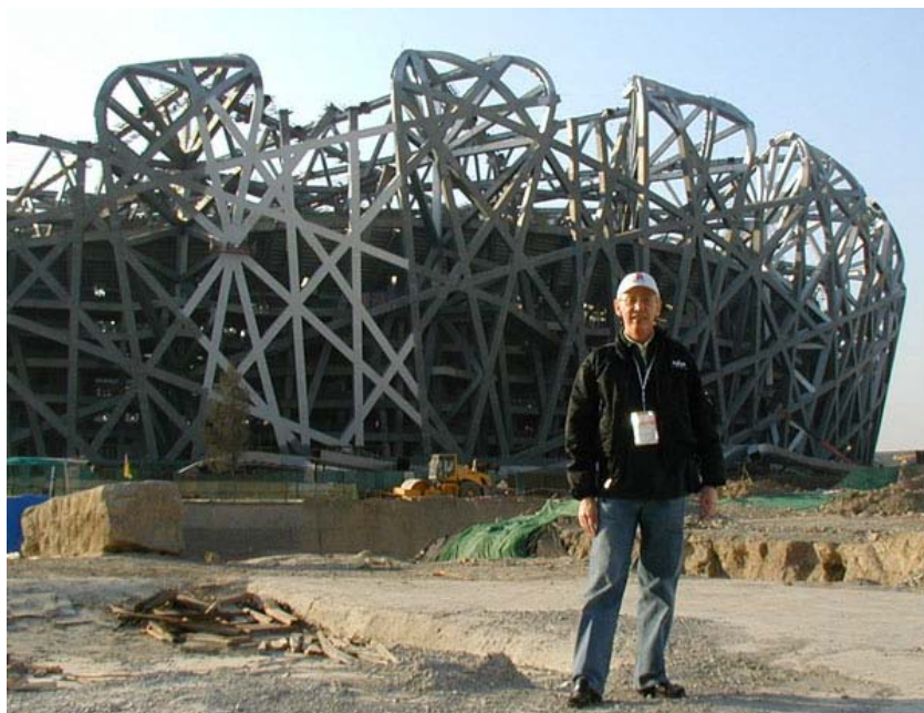
The Birds Nest under construction