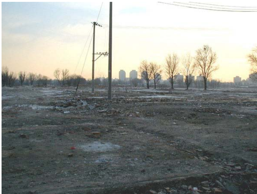
How it looked on the "SPOT" before all construction started

Van Kerckhove was sometimes amazed by the capital city's long-term consideration. "Actually the area for the Olympics was reserved decades ago by the Beijing urban planners, making its construction relatively easy. No building permits were given so few buildings needed to be removed, except for some migrant housing," he said.