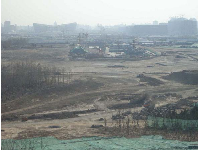
The forest park and lake under construction

The couple would first have heated discussions between themselves before coming to a common understanding and strategy. Then, they would act accordingly to execute the strategy, coming out as a "united team".