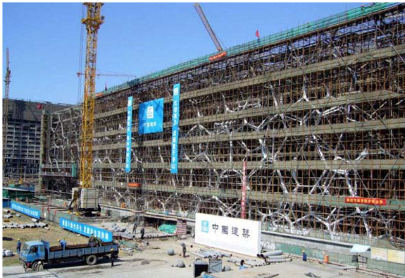
The Water Cube under construction